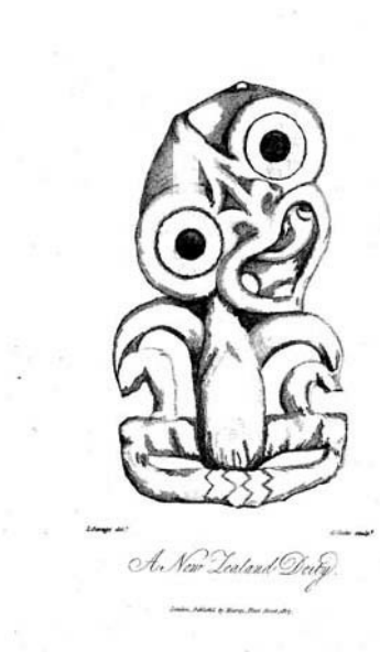
A New Zealand Deity

When paying their adoration to the rising sun, the arms are spread and the head bowed, with the appearance of much joy in their countenances, accompanied with a degree of elegant and reverential solemnity: The