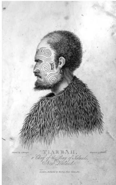
TIARRAH, a Chief of the Bay of Islands, New Zealand.

Drawn by J.Savage, Engraved by G.Cooke London, Published by Murray, Fleet Street, 1807.